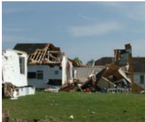
Tornado cuts swath through Navy family's house

Most are aware of the tornado that ripped through Suffolk, Virginia on Monday, April 28, 2008, that destroyed homes, lives and dreams of so many. As these families begin to rebuild, they could not do it without the compassion of others within its community and those who feel compelled to go the distance to offer a helping hand from afar. In the wake of the tornado, organizations within Suffolk began to mobilize and coordinate volunteer efforts reaching out via emails and any other means necessary.