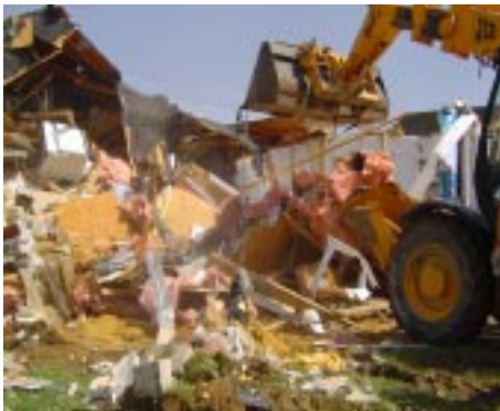
Bulldozer moves debris