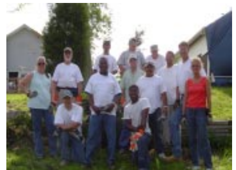
Volunteers taking a well-deserved break

tively representing the Eastern Shore of Virginia.