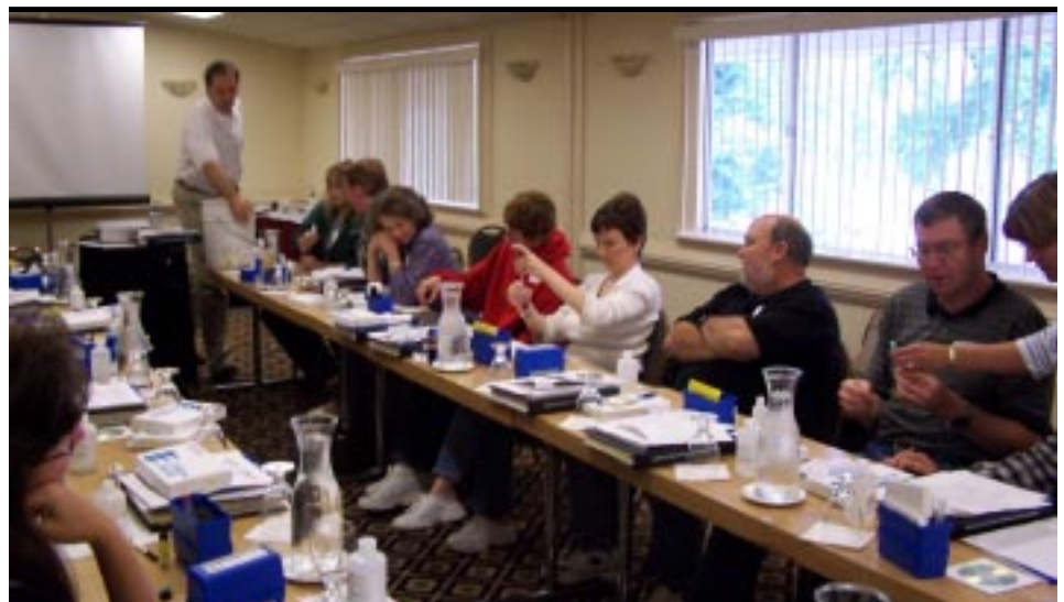
Participants at another Well Owner Network Training on the Delmarva Peninsula