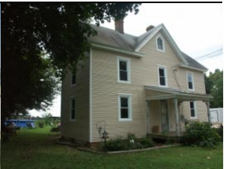
(Left) A house that is beginning the Lead Safe Homes Program. (Right) A house that has been completed under the program.